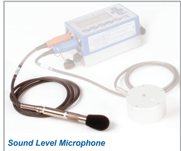
Sound Level Microphone

NOTE: The sensor check function only works in Compliance Mode.